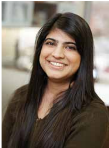
Machal • Financial Inclusion