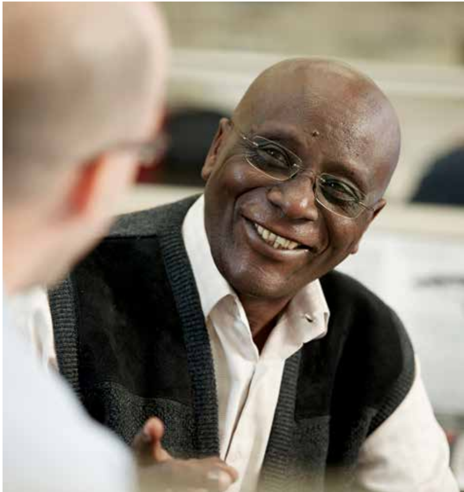
Konde • Youth Learning